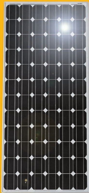
Monocrystalline module (detail view)